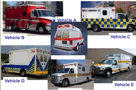
Fig 1. Study vehicles

With now numerous USA "safety concept" ambulance vehicles being showcased and distributed into EMS markets, this study's objective is to evaluate the potential safety performance of the more recent 'safety concept' ambulances based on accepted human factors and occupant protection principles, and existing data.